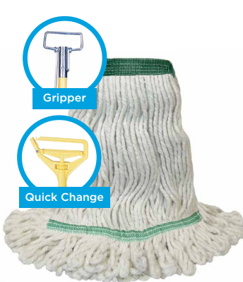
Ask about our color options