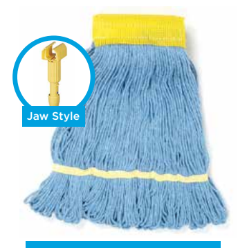
Ask about our color options