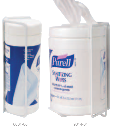
A variety of canister brackets and mounting options are available