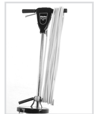
50 ft safety yellow cord.