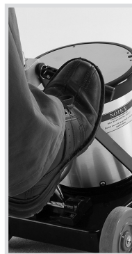
Foot-activated handle lock.