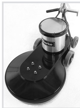
Cast aluminum chassis.