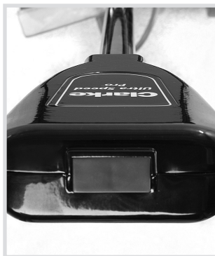
Safety lock-out switch.

The Ultra Speed Pro® 1500 features a powerful DC rectified motor that drives a consistent 1,500 rpm's to maintain a wet-look shine on finished floors. With easy-to-use fingertip controls and multiple safety features, such as handle-mounted safety switch and circuit breaker, and a 50 foot yellow cord, this machine gets the job done fast. The handle can be operated on the locked position or allowed to float. A flexible pad driver is included.