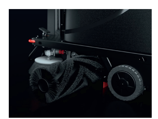
Productive start to finish Wide cleaning path, large debris hopper, and speed combine to get the job done fast.