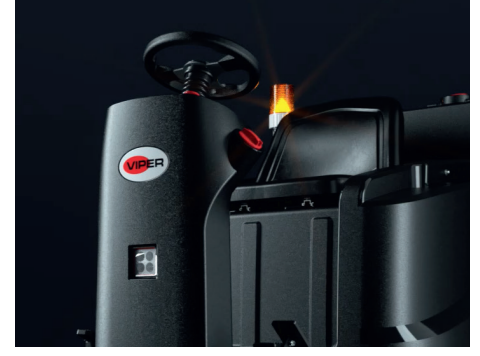
Built with safety in mind Help reduce employee and property risks with the safety-minded design