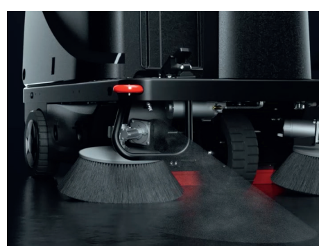
Keeps the dust down Control and containment of dust with the wet misting system insures superior results