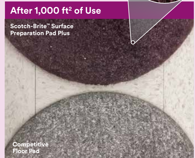
Caked on finish and dirt can interfere with floor pad performance.

Open fiber construction helps prevent clogging during use.