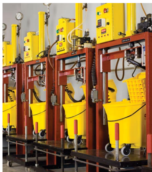
WaveBrake® wringers last twice as long as the competition, exceeding 50,000 wring cycles. We test and retest our products to meet our rigorous durability standards.