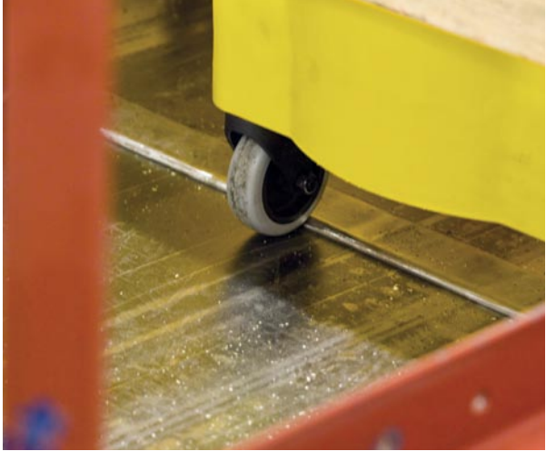
WaveBrake® casters are tested on a wide range of floor surfaces and thresholds—proving their long-lasting durability.