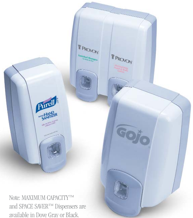
Note: MAXIMUM CAPACITY™ and SPACE SAVER™ Dispensers are available in Dove Gray or Black.

Since 1946, GOJO has been a leading supplier of hygiene and skin care products for healthcare, manufacturing, education, foodservice, automotive and other markets. Our brands are formulated to clean hands, kill germs and help keep skin soft and healthy looking, even with the frequent use often required in these professional environments.