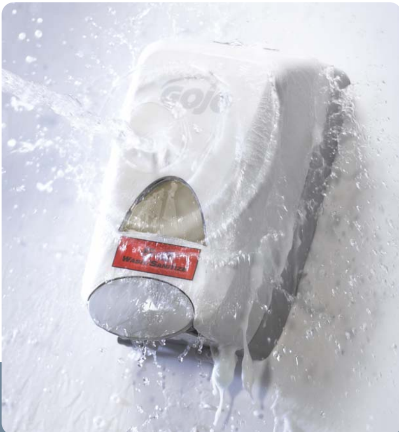
Durable dispensers for wash-down environments.