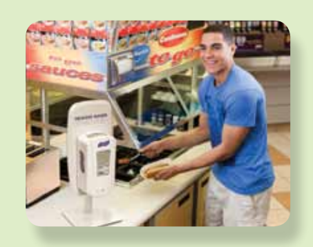
FRESH FOOD / PREP AREA PURELL Table Top Stand (2426-DS) with LTX™ Dispenser (1920-04)