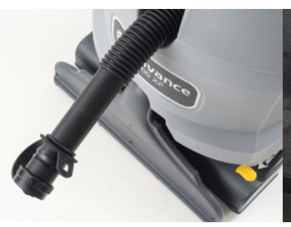
The front-mounted nozzle makes dumping much faster and easier for the operator.