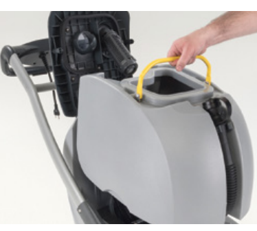
The removable, increased capacity tank along with the stowable handle make refilling much simpler.