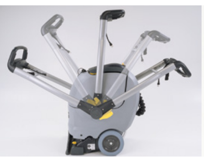
An adjustable handle allows for easy maneuverability, decreasing the need for backing into tight spaces. (ES400 ^{\text{TM}} XLP shown)