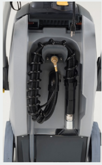
Integrated hand tool (standard on XP and XLP models)

Visit http://www.advance-us.com or contact your Advance sales representative to learn more.