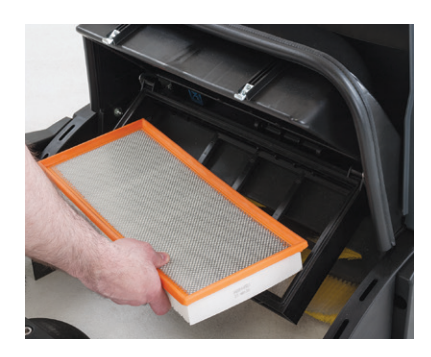
Single-stage high capacity dust control system for more effective dust control. Access filter without tools.