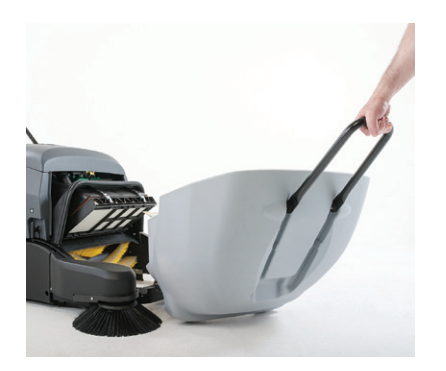
Single hand hopper removal and installation with wheels to facilitate easy transport for dumping.

Entertainment Facilities Hotels and Hospitality Facilities