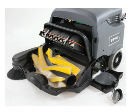
Time-saving maintenance: Broom replacement, and other routine maintenance, can be performed without tools.