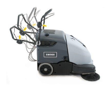
Handlebar adjusts to fit a wide range of users and folds to provide convenient transport and storage.