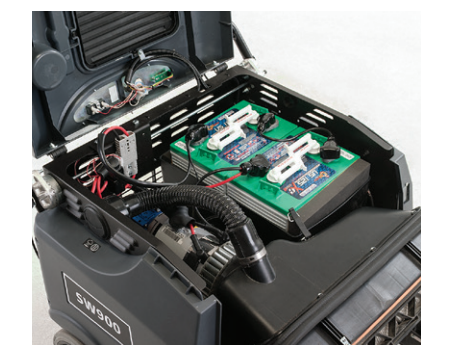
Hood opens providing full maintenance and service accessibility to the battery compartment.