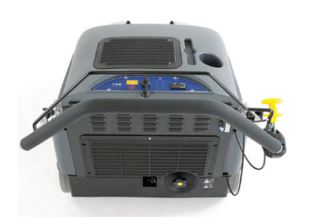
Both brooms are adjustable from the operator's position.