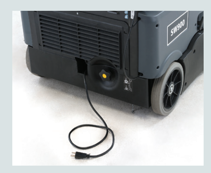
An onboard charger provides the convenience of charging anywhere a power outlet is available.