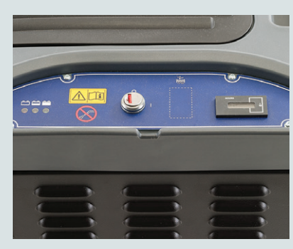
Control panel with key switch, battery charge indicator and hour meter.