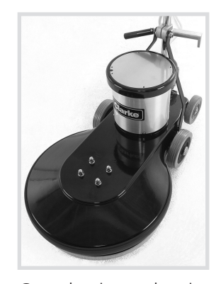
Cast aluminum chassis.