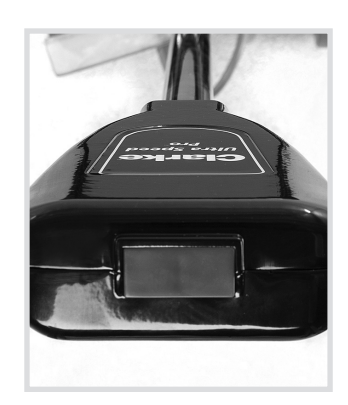
Safety lock-out switch.