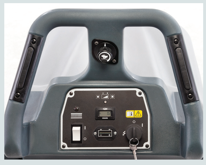
Traction drive model features speed control and reverse button.