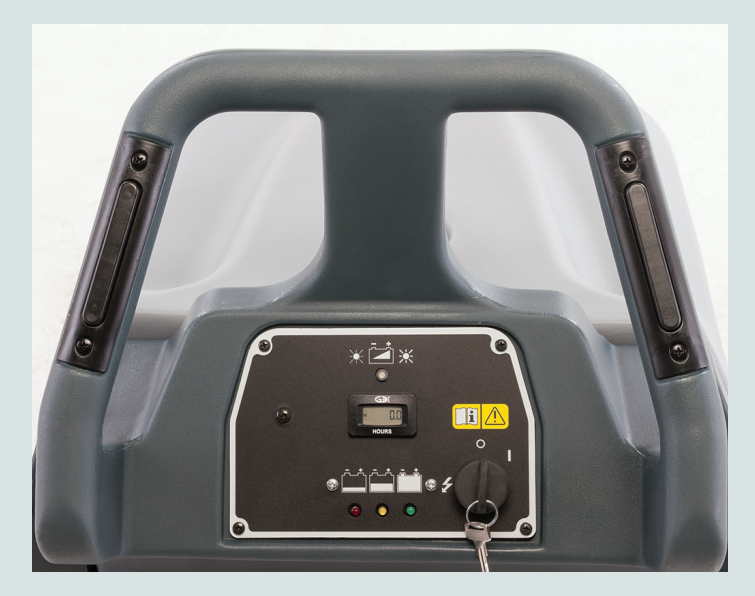
Easy to operate control panel and palm switches. Non-traction model shown.

The Advance BU800 battery burnisher delivers the smooth performance, consistent shine, and cleaner indoor air quality that is demanded by today's customers.