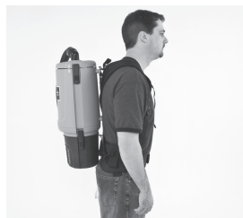
Adgility™ XP fits comfortably on the operator.