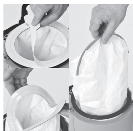
Full dust bag can be sealed before removal to contain all dirt.