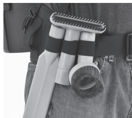
Accessory loops keep tools handy while operating.