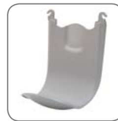
2760-06 (For use with TFX Dispenser)

Help maintain wall and floor appearance by attaching to dispenser.