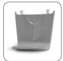
5145-06 (For use with FMX Dispenser)