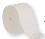
4.75" diameter — 36 rolls/case