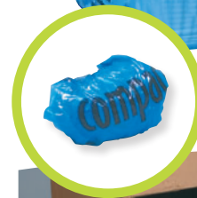
One Case of Waste— Compact vs. Standard Roll Bath Tissue