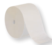
5.75" diameter — 18 rolls/case