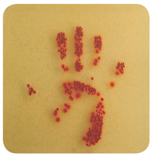
Hand contaminated with bacteria commonly found in foodservice environments after washing with bulk soap

GOJO offers a variety of state-of-the-art delivery systems, including our TFX<sup>TM</sup> Touch Free dispensers and FMX<sup>TM</sup> durable manual foam dispensers – all are easy to install, easy to use and easy to maintain.