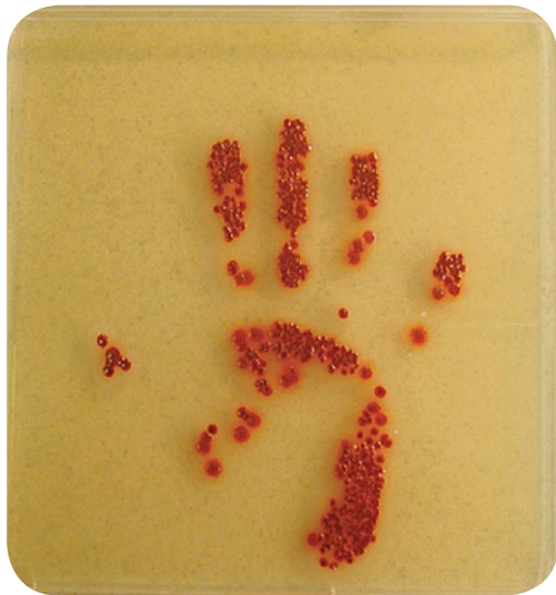
Hand contaminated with bacteria commonly found in foodservice environments after washing with bulk soap

GOJO has conducted extensive research across a variety of handwash / hand sanitize regimens. Not all soaps and regimens are the same.