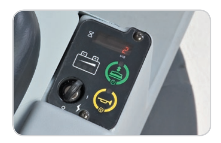
Simple, One-Touch \mbox{^{\tiny TO}} operators button.