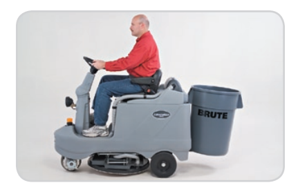
Equipped with optional accessory kits, the Advolution™ 2710 becomes multi-functional.