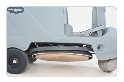
Mid-mounted, burnishing head tilts up for access to change burnishing pads quickly and easily.