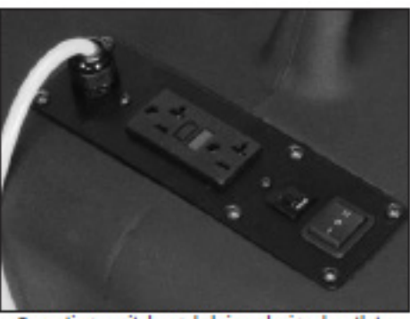
2 postion switch and daisy-chained outlets