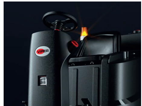
Built with safety in mind Help reduce employee and property risks with the safety-minded design

Nilfisk, Inc. 9435 Winnetka Avenue North Brooklyn Park, MN 55445 www.nilfisk.us Phone 800-989-2235 Fax 800-989-6566 L3522V_0422