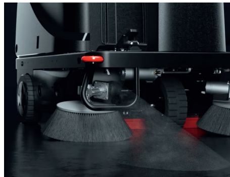
Keeps the dust down Control and containment of dust with the wet misting system insures superior results