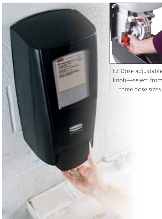
EZ Dose adjustable knob—select from three dose sizes.

An ideal system for heavy-duty cleansing and worker protection for the maintenance and grounds staff. Keep hard-working hands clean, healthy, and on the job with the most environmentally responsible product line in the industry.