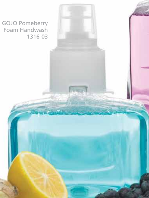
GOJO Pomeberry Foam Handwash 1316-03