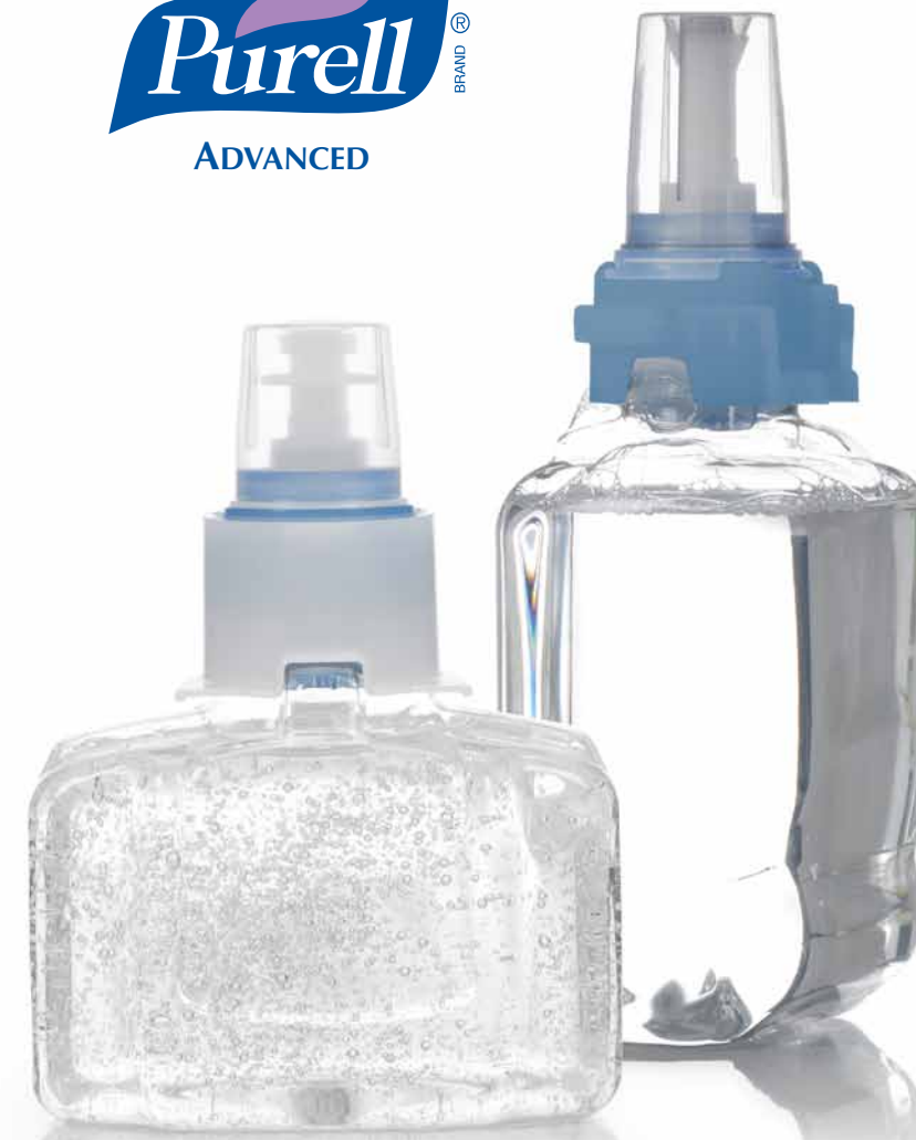
PURELL Advanced Green Certified Instant Hand Sanitizer 1303-03