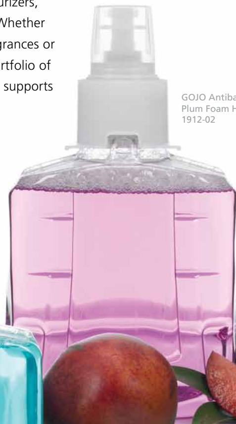
GOJO Antibacterial Plum Foam Handwash 1912-02