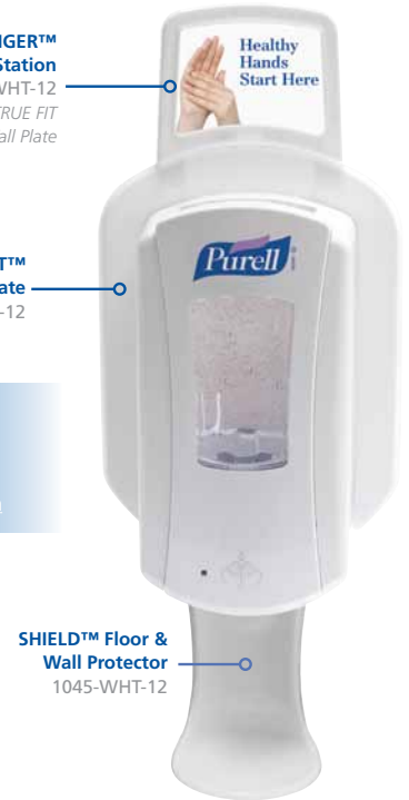
SHIELD™ Floor & Wall Protector 1045-WHT-12