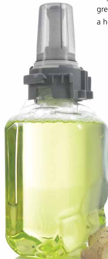
GOJO Citrus Ginger Foam Hand & Showerwash 8713-04

These new systems offer a selection of luxurious foam formulations enriched with moisturizers, natural extracts and skin conditioners. Whether you prefer vivid colors with spa-like fragrances or fragrance- and dye-free options, our portfolio of green-certified soaps delights users and supports a healthy environment.