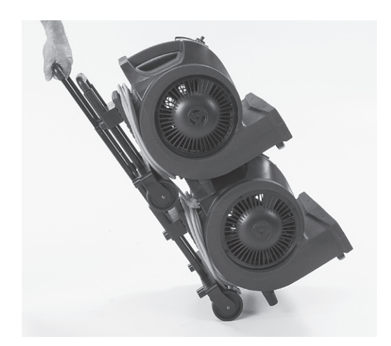
Optional trolley kit, with transport wheels and retractable handle.