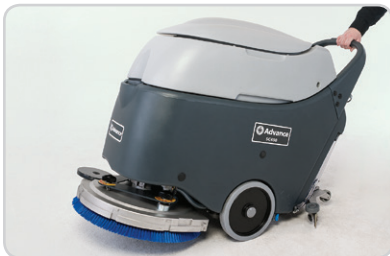
The SC450™ tips back with minimal pressure required for efficient transportation.