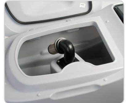
Large recovery tank with easy access allows easy inspection and cleaning.