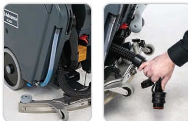
Solution drain hose also functions as the solution level indicator while large recovery drain hose offers soft, squeezable section to enable manual flow control.