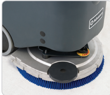
Adjustable machine deck provides increased down pressure to optimize scrubbing for heavy-duty applications.