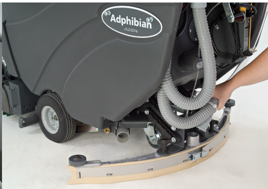
For a full-functioning scrubber, move the hose to the squeegee and lower the squeegee to the floor.