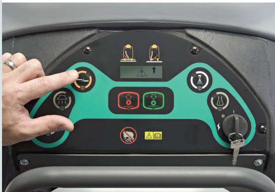
A single touch to the orange button tells the user what mode the Adphibian™ is changing to.

Large Retail Facilities Hotels Airports, Train Stations, Bus Depots Hospitals/Healthcare Facilities Schools and Universities Casinos Churches and Religious Facilities Government Buildings Health Clubs Office Buildings