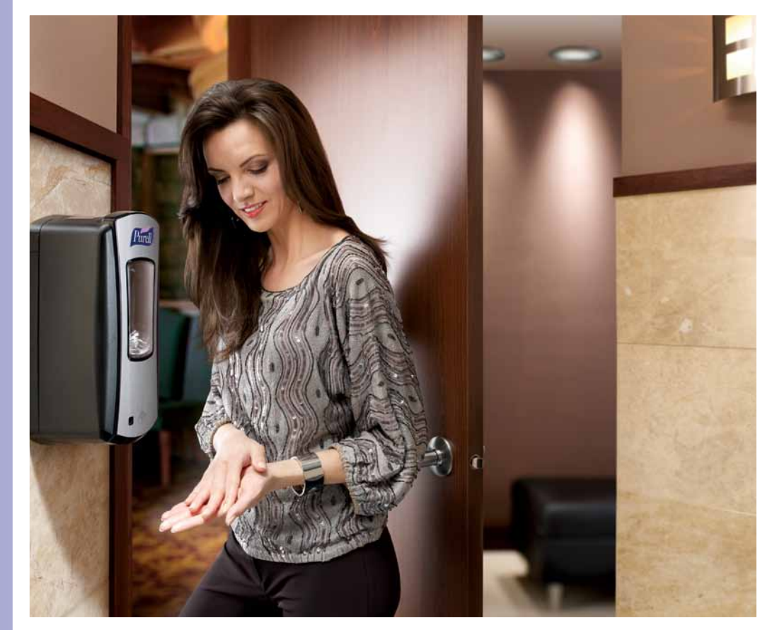
PURELL® Perfect Placement at restroom exits.

Spotlight the value you place on GUEST and STAFF well-being.