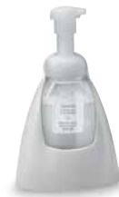
GOJO Gentle Foaming Cleanser 5712-12-KIT

Upgrade guest experiences while saving money. Replace guest room bar soap with GOJO Gentle Foaming Cleanser.