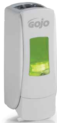
GOJO ADX-7 8780-06

Performance Guaranteed LTX and ADX systems carry the GOJO Lifetime Performance Guarantee – a dependability promise that even includes the LTX batteries.