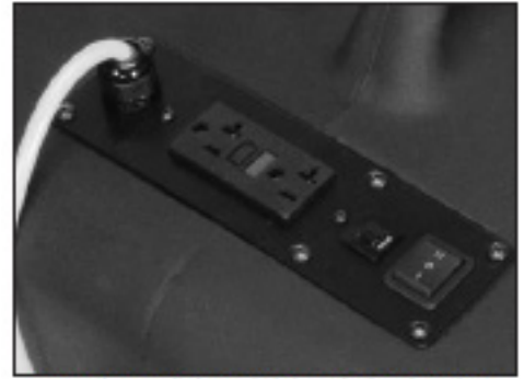
2 position switch and daisy-chained outlets