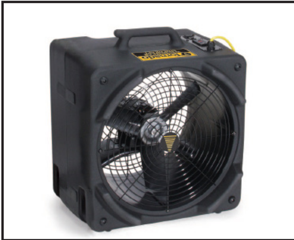
WINDSHEAR™ SIDEDRAFT MODEL NO: 98782 (115V & 98783 (230V)

Operations & Maintenance Manual For Commercial Use Only